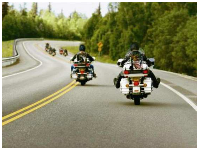
The road beckons...

couple of the bike events as the weather turns. I am praying it is better than last year. Whether it is the economy, age or apathy, the turnouts are down. Fewer people getting out and going means its harder and harder to stay in touch. We were surprised to hear of a couple of the guys passing this past winter, the word just didn't get around and that isn't a good thing.