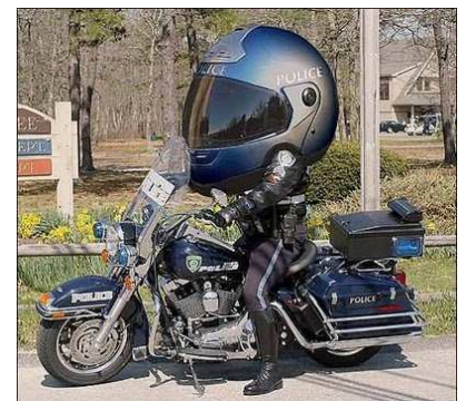
That ought to do it...!

A laboratory study is being conducted to see just how all this works and its impact on a drivers performance. The test isn't designed to end wearing helmets but to find ways to reduce hearing damages... I say just get rid of the helmet!