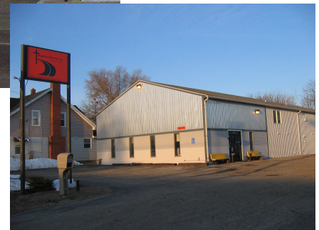
2011 and a whole lot of changes since!

vehicles and show boats will be ready to go too.