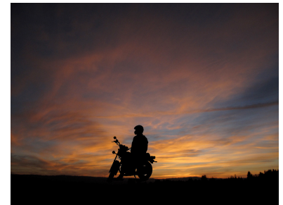
The last ride home...