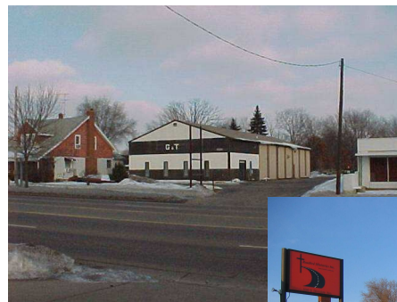
2001 and we had just moved in!

We still have a few things to finish up in that respect. I have a 1937 Ford Pickup that is being redone and painted, the Fire Trike will be DONE this Spring and the "ambulance trailer" will have been completely refurbished. That means the chase