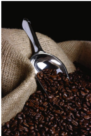
Nothing but the best beans for you guys!

Ever plan something and think, "This won't take any time at all..."? Well I sure have and the latest installment of that was the coffee shop! Now we started with good intentions, with Cappuccino Joe's being gone, DC Cage history, PJ's closed, we thought it was time to start one of our own so everybody would still have a place to hang out, have a good cup of coffee and keep in touch. I mean we've had everything all along, we just needed to get the right permits right? Wow!